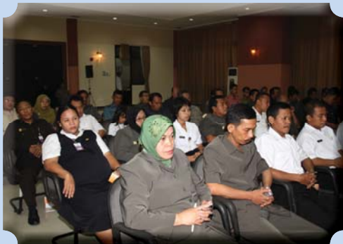
Members of Lemhannas RI attending the Celebration of Isra' Mi'raj

It can be summarized that the core of the celebration of Isra' Mi'raj is that human should always remember God in order that Hablumminallah and Hablumminannas could be maintained so that the world life and the hereafter can be integrated appropriately and balanced and applicable in daily life.