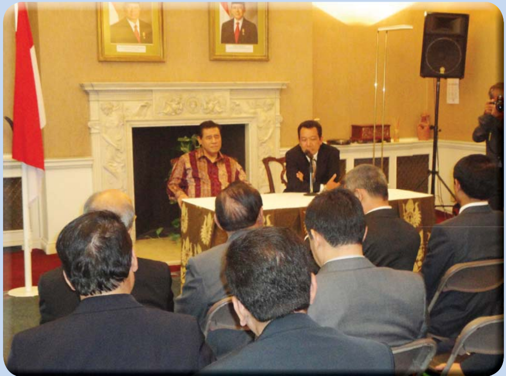
Head of Political Division of the Embassy of the Republic of Indonesia welcome the Governor of Lemhannas RI together with participants of SSLN

Further, the Governor of Lemhannas RI conveyed information on Indonesia's experience in building National Resilience. That National Resilience of Indonesia was built through various aspects of National Resilience as owned, such as Geography, Demography, Natural Assets, including ideological, political, economic, socio-cultural, Defense and Security aspects. All of them refer to Comprehensive Security concept containing State Security and Human Security. To that end, the national