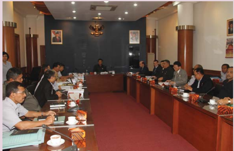
Meeting on preparedness of PHLN project between Lemhannas RI CIMSA in Meeting Room of Nusantara I, Trigatra Building adjustments in agreement contract.