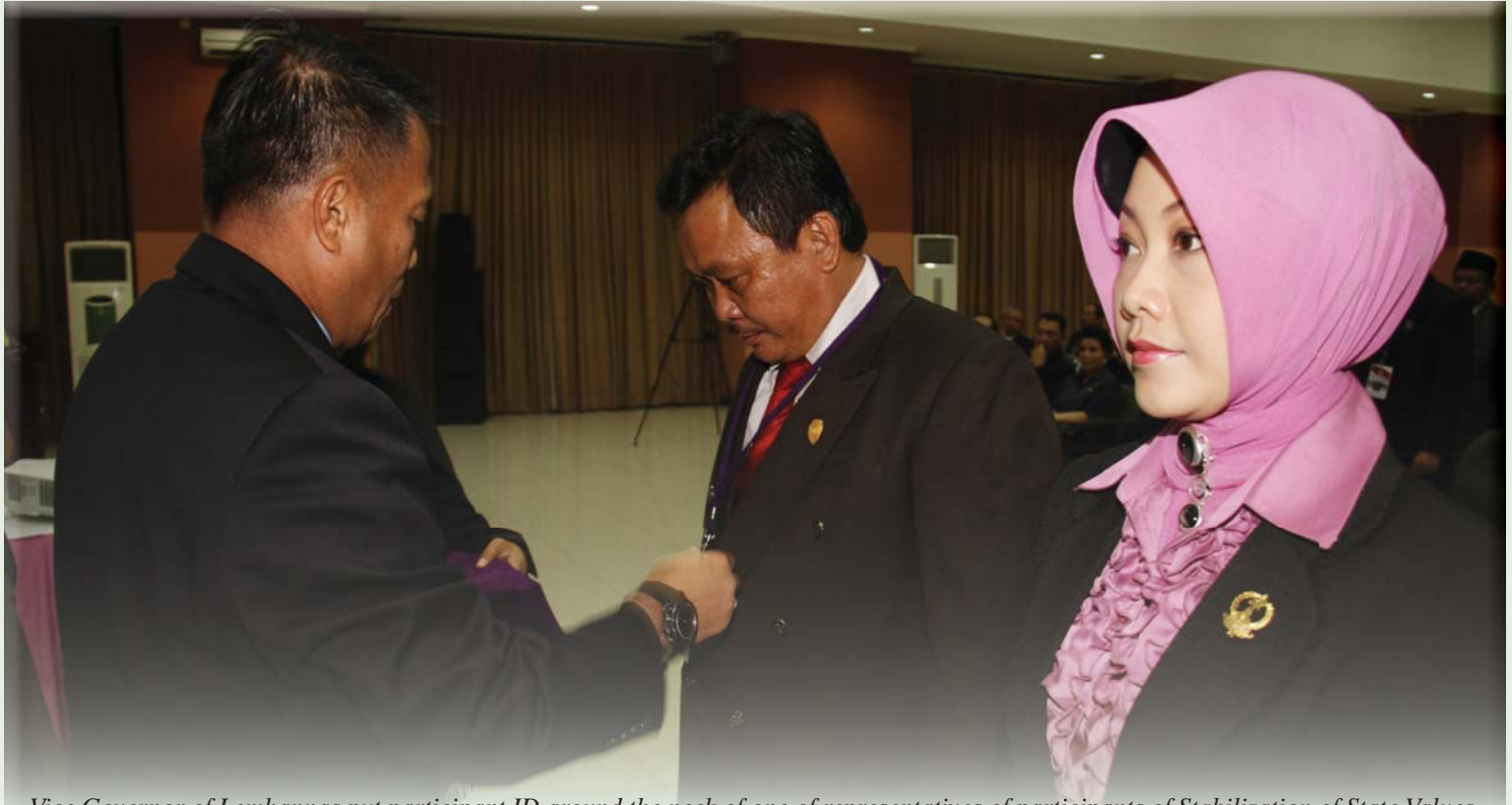
Vice Governor of Lemhannas put participant ID around the neck of one of representatives of participants of Stabilization of State Values, National Conception and Leadership

S tabilization of State Values, National Conception, and Leadership is a part of democracy consolidation. Principally, this stabilization is an effort to give illumination dialogically with material being the core subject of Lemhannas. The Governor of Lemhannas RI, represented by Vice Governor of Lemhannas RI opened the event on June 28, 2010 in Dwiwarna Building. Participants of Adeksi of Group XXIV originating from Regional Government Official, Leader, and Member of Provincial Parliament throughout Indonesia.