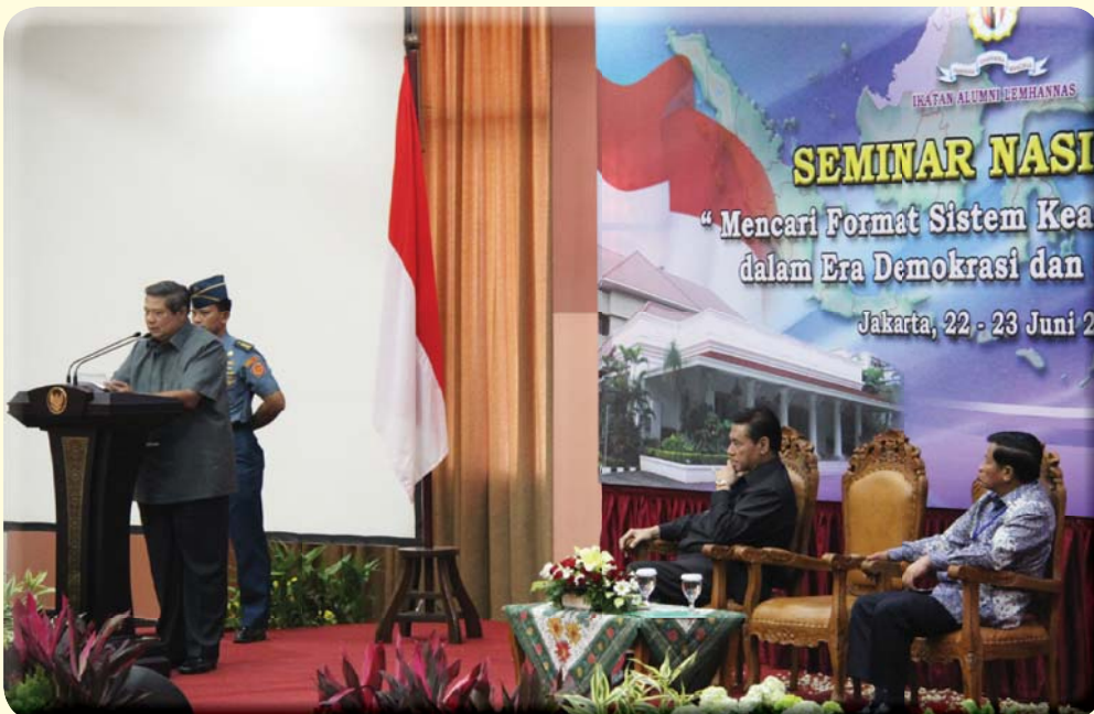
President of the Republic of Indonesia, DR. H. Susilo Bambang Yudhoyono opens National Seminar of IKAL in Dwiwarna Purwa Building of Lemhannas RI

In the framework of approach to find format of national security system, it should be acknowledged that Indonesia needs a socio-engineering process together with society in maintaining, prioritizing, and encouraging national interest as main consideration for every step taken in building this country, and establishment of legislation for national security system is considered very important with preparatory phases of agreement in respect of concept, assumption and national security strategy.