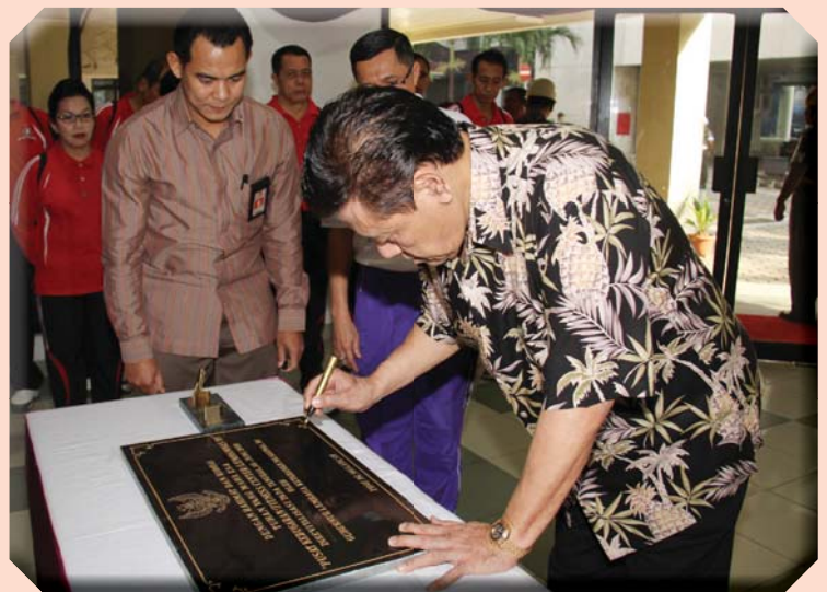
Signing of inauguration commemorative plaque of fitness center on ground floor in Widyaswara Building of Lemhannas RI

Procurement of the sport facility uses State Budget of fiscal year of 2010. Therefore, expectedly the facility will always be maintained appropriately, thereby having long useful and economic life.