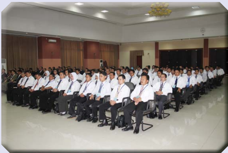
Participants of Stabilization of State Values for Young Generation of Group II

As agent of development, the young generation has the task to build nation in all aspects, either physical or non-physical in nature. The Young generation playing its role as agent of modernization has the task and act as pioneer and innovator, the spirit of pioneering and innovator should be owned by the young generation and minimize