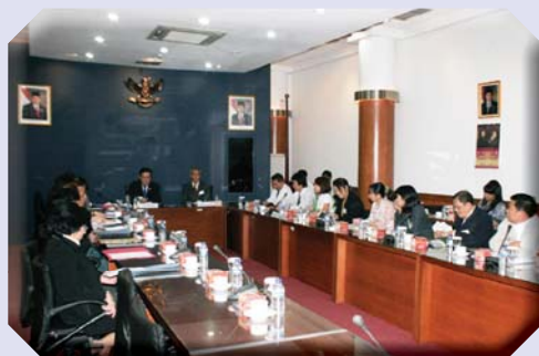
Situation of discussion in Meeting Room of Nusantara I, Trigatra Building, Lemhannas RI

The session was closed at 12.00 AM. Before leaving Lemhannas RI, the delegation of Myanmar took pictures with the Governor, Vice Governor and the other officials of Lemhannas RI.