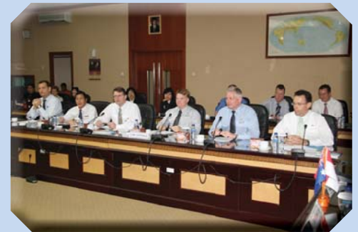
Delegation of the Australian Defence College for Defence Strategic Studies (CDSS)

In addition to threat of terrorism, discussion also relates to global issue that should be encountered by the world, including Indonesia, in the future among others consisting of climate change, scarcity of energy, food and others. However the food crisis issue is not