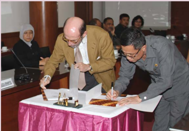
signing of Contract Amendment of PHLN Project between Lemhannas RI and CIMSA

Further, Lemhannas RI, in cooperation with CIMSA, has conducted a comprehensive survey to map current ICT condition of Lemhannas at present and make detail identification of technical need of infrastructure, system development, training, and so on. The above identification has been summarized in needs in the master plan of ICT of Lemhannas RI, functioning as roadmap and indicator on