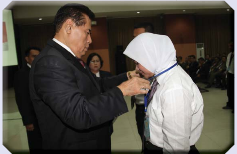
Governor of Lemhannas put Participant's ID around the neck of one of representatives of participants of Stabilization of State Values for Young Generation of Group II