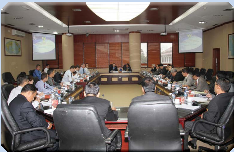
Situation of discussion held in Asta Gatra Building, Floor III West between Lemhannas RI and delegation of the Australian Defence College for Defence Strategic Studies (CDSS)

The session was ended at 12.00 AM and was closed with taking pictures with delegation of Australian Defence College-Centre for Defence and Strategic Studies and officials of Lemhannas RI and participants of PPRA XLIV in front of Asta Gatra Building.