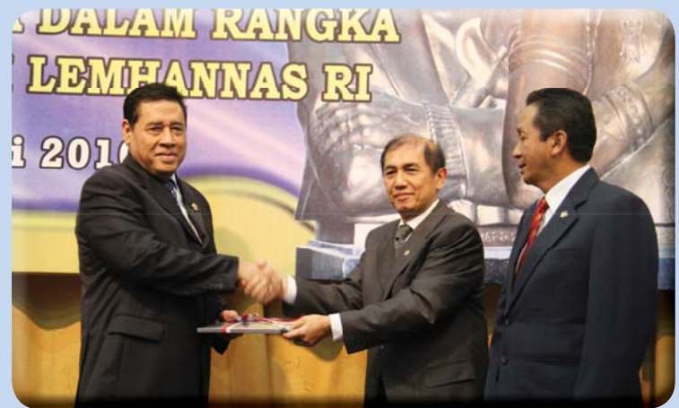
Submission of audit findings of BPK-RI by Chairperson of BPK-RI to the Governor of Lemhannas RI, of which the Lemhannas RI earns again the predicate of WTP for the third time consecutively

In this respect, the Governor appeals that the member of Lemhannas RI makes desire for participation a central point of mindset and culture in organizing daily social, national or state life.